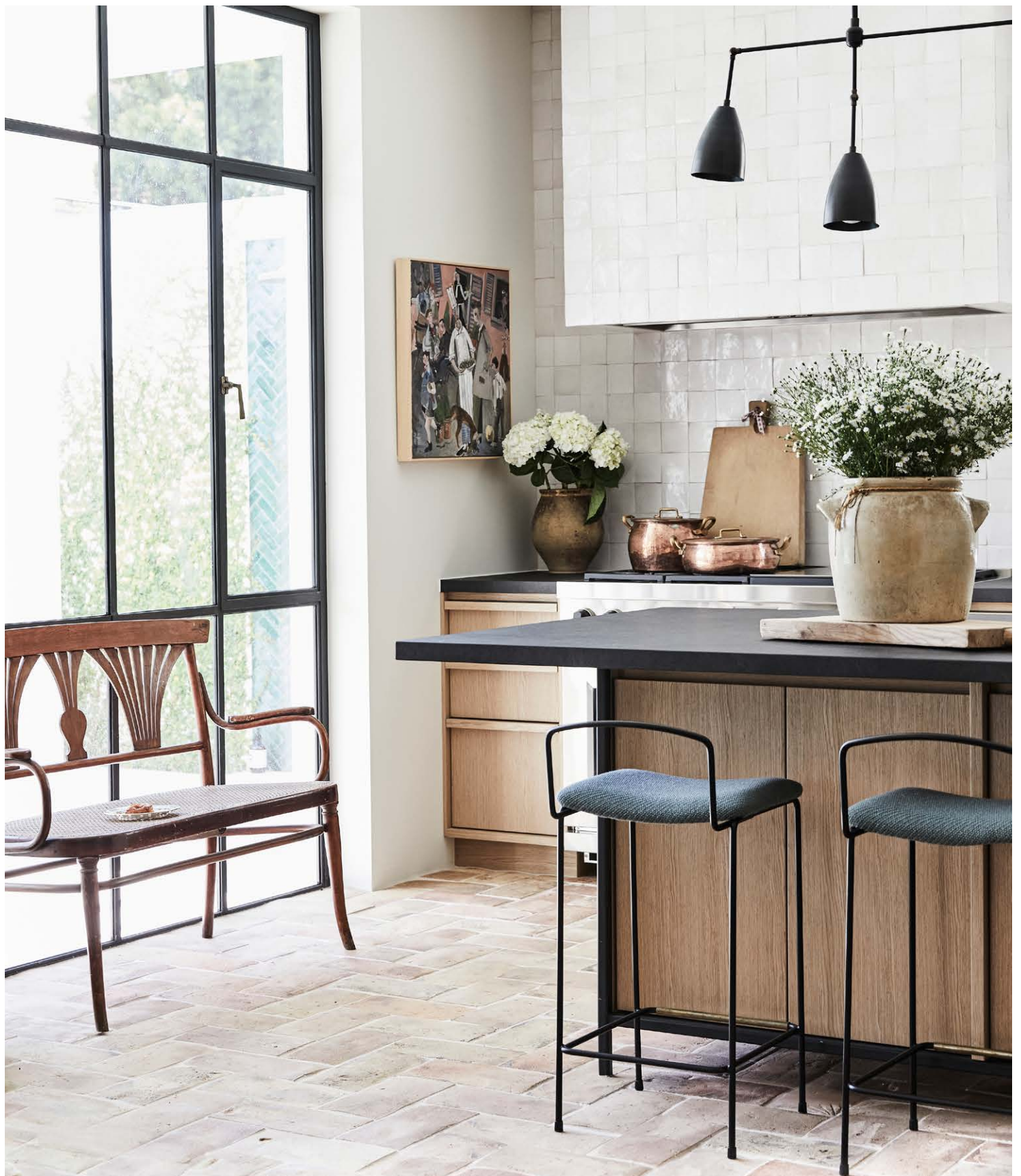
KITCHEN Walls painted Dulux White Duck Quarter. Joinery in TrueGrain 'Bouchon' veneer, Briggs Veneers. Benchtop in Montauk Black Slate, Bisanna. Splashback in Moroccan 'Casa' white glazed terracotta tiles, Onsite Supply+Design. Vintage Bentwood seat, French Biot pot, chopping board, copperware and cream confit pot, all Dusty Luxe. Artwork by Martial Cosyn, Ferris Wheel Gallery. 'Dita' bar stools, Grazia & Co. Apparatus 'Twig 5' pendant light, Criteria. Floor in 'Malina' recycled light terracotta tiles, Gather Co. DINING 'Double Bell' table, The Wood Room. Moroso 'Mathilda' dining chairs, Mobilia. Antique French oak carver chairs, and bowl on table, Dusty Luxe. Apparatus 'Median 2' pendant light, Criteria. Floor in 'Malina' recycled light terracotta tiles, Gather Co. Pears and Shadow artwork by Esther Eckley, Michael Reid Murrurundi. Bowl of Lemons artwork by Laura White. KITCHEN VIGNETTE Chopping board and cream confit pot, Dusty Luxe. Commissioned artwork by Bethany Saab.