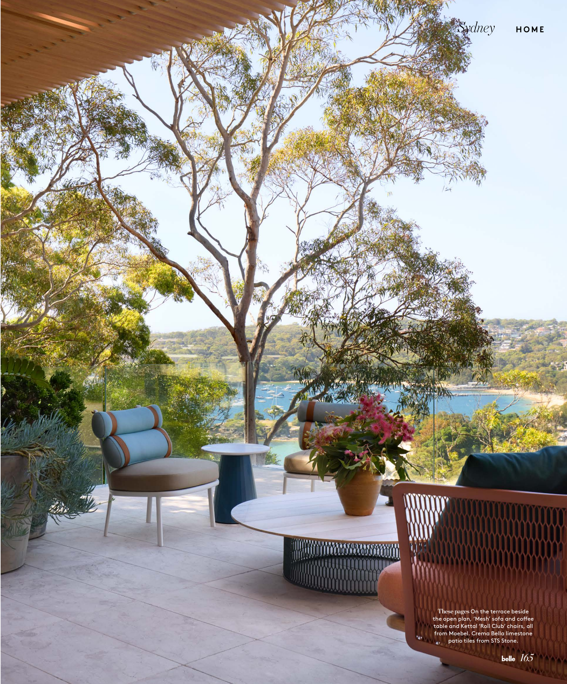
These pages On the terrace beside the open plan, ‘Mesh’ sofa and coffee table and Kettal ‘Roll Club’ chairs, all from Moebel. Crema Bella limestone patio tiles from STS Stone.

Architect Koichi Takada boldly ventured outside the box with this luminous home hugging a hill on Sydney’s lower North Shore, its curves and parallel lines evoking the perfection of a palm frond. “Nature’s umbrella, the palm frond provides shelter from sun, wind and rain in the same way as our screening protects this home,” says Koichi. “The effect is an endless display of shadow and light.” Similarly, the interiors by Hugh-Jones Mackintosh, echoing Koichi’s inspired exterior, share those curves, lines and textural richness. So it’s little wonder, for the owners, living in the home is like a ‘frond embrace’. The couple were living next door when in 2016 this property came on the market and proved irresistible. “It was a much larger block of land, with impressive views out to the [Sydney] Heads,” says the owner. But the views were hogged by a pile of indeterminate age. After toying with renovating, the only option was to bring in the bulldozers and start afresh. The owner was already familiar with Koichi’s work which references »