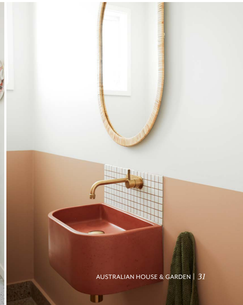
Moroccan terracotta brick tiles, Bisanna. Doric basin, Meek Bathware. Yokato tapware, Brodware. Wall painted Dulux Recycled. OPPOSITE TOP A rattan console from Rudi Rocket sits under a window hung with Chinois woven bamboo blinds from Blinds by Peter Myer. Flynn wall sconce, Serena & Lily. Throw, LRNCE. OPPOSITE BOTTOM RIGHT Concrete basin, Nood Co. Mosaic tiles, Onsite Supply+Design. Yokato tapware, Brodware. Walls painted Dulux Recycled. OPPOSITE BOTTOM LEFT A vintage chair sits in the corner of the bedroom. Wavy floor mirror, Composition by Office Elias. ▶