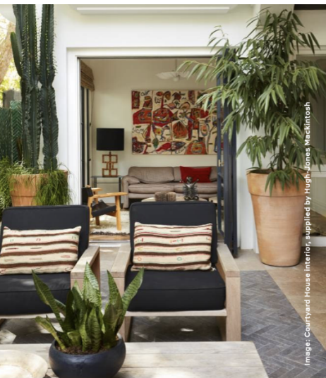
Image: Courtyard House interior

What do you think is the reference pinnacle for mid-modern century style and why?