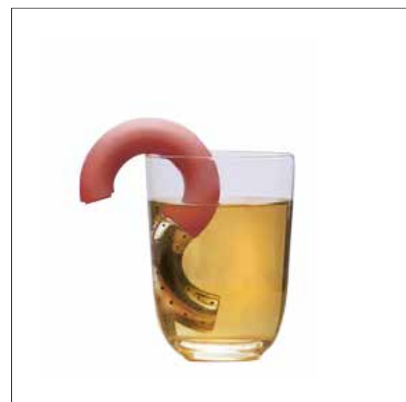
Torus Tea Infuser Set by Ommo, $68 THESTORE.COM.AU