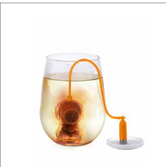
Abel Design Deep Diver Tea Infuser, $20 PRINKBOX.COM.AU