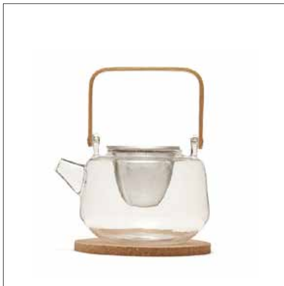
Salt & Pepper Canteen Tea Pot With Infuser, $60 DAVIDJONES.COM.AU