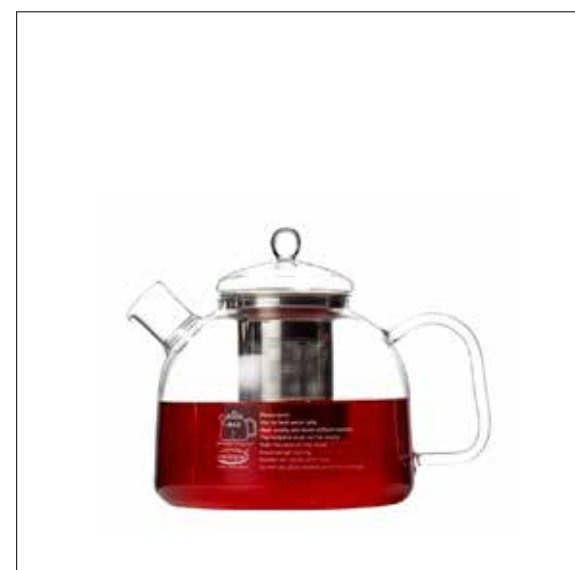
Water Kettle Large, $85 T2TEA.COM